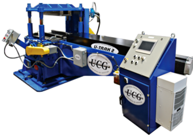
U-Trak 2 system retrofit to Yoder press View Photos